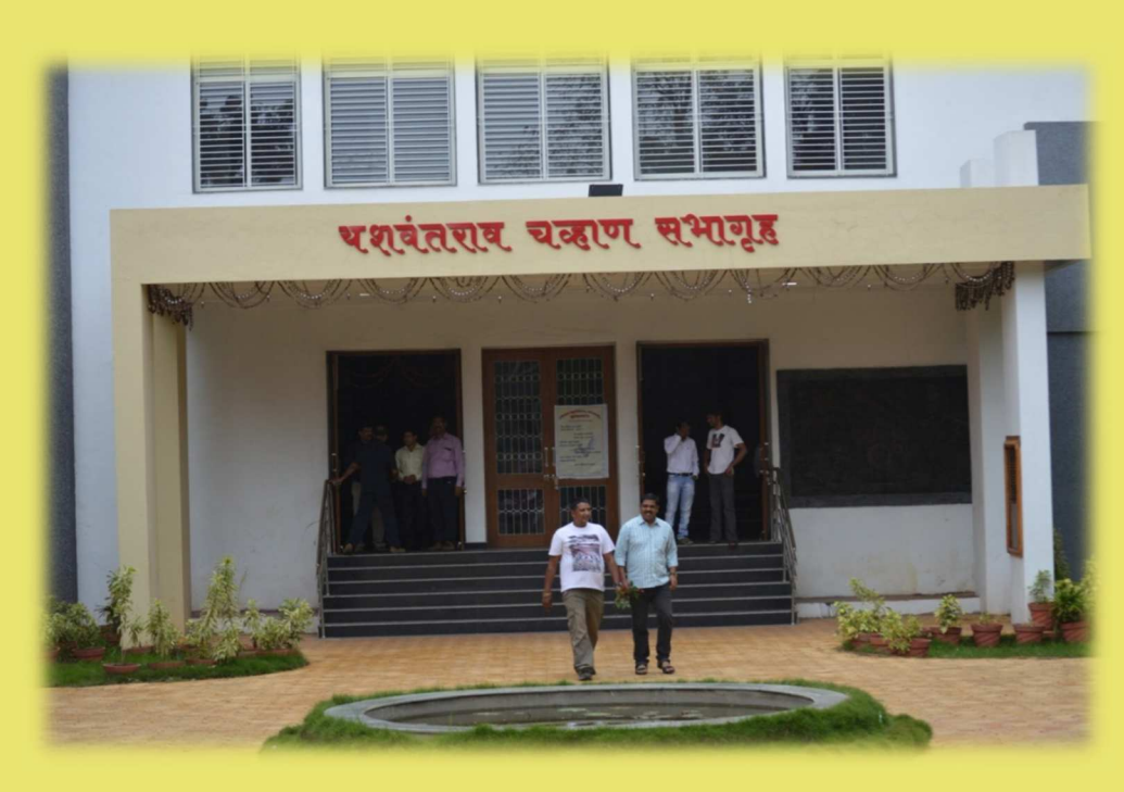
Yashwantrao Chavan Auditorium